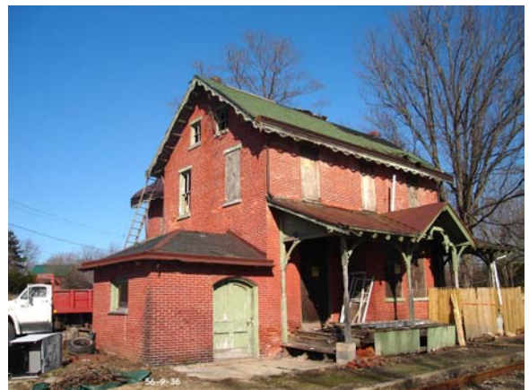
Lincoln University Railroad Station (1880)