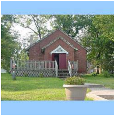
Hosanna AUMP Church (1843)