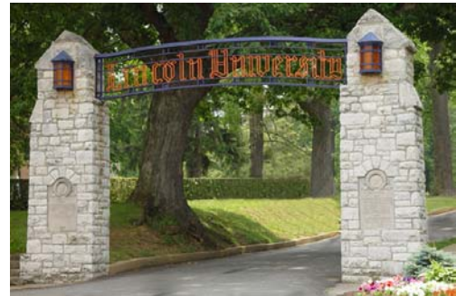
Lincoln University Arch